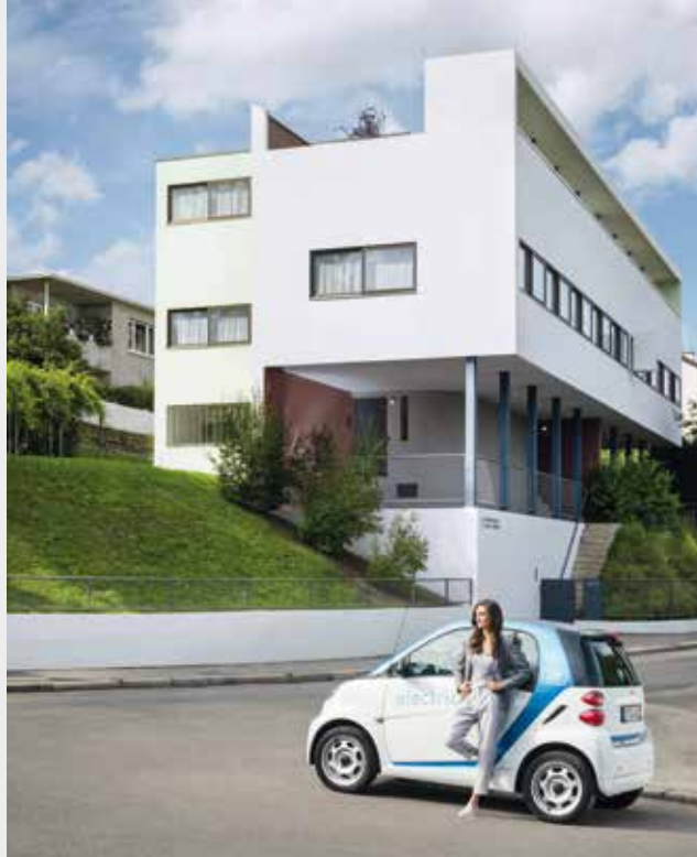
This photograph is copyright protected and may not be disseminated or copied.