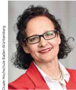
Duale Hochschule Baden-Württemberg